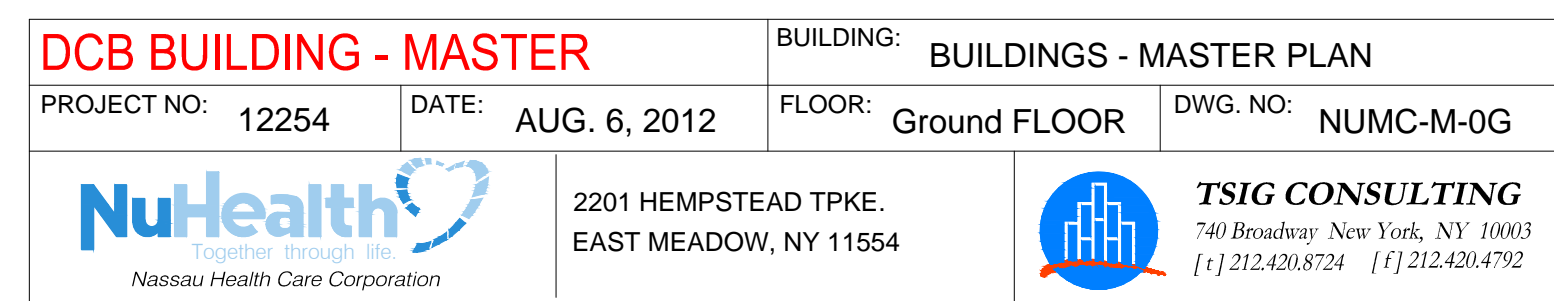
'DCB' BUILDING GROUND FLOOR